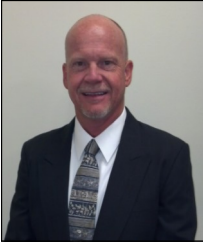
By Don Douglass

In May of 2013, we set out to show County officials and department heads that this year's contact negotiations would be different than it had been in the past. We outlined an approach to negotiations that would show the County's representatives that we were prepared to back up our proposals with data justifying our demands. We showed them respect and we expected them to show our representatives the same.